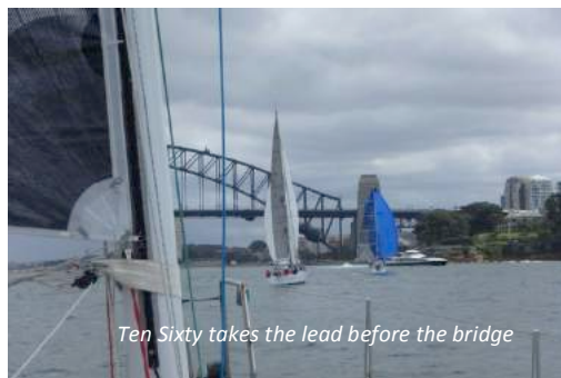
Ten Sixty takes the lead before the bridge