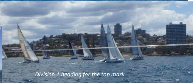
Division 1 heading for the top mark