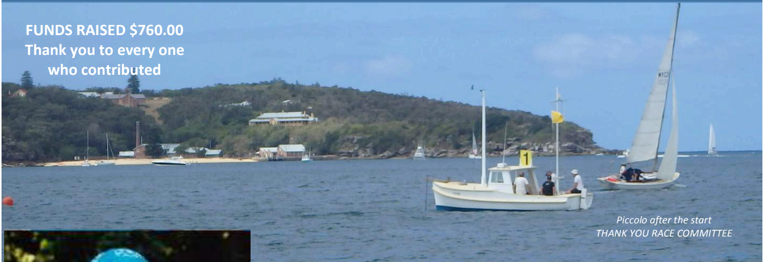
Piccolo after the start THANK YOU RACE COMMITTEE

FUNDS RAISED $760.00 Thank you to every one who contributed