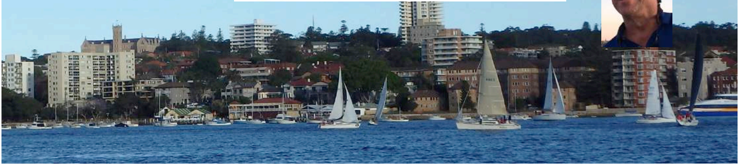
2017-2018 Twilight Series Race 5 - TL5 - 10 November 2017