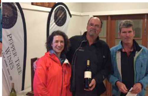
2 nd place Piccolo