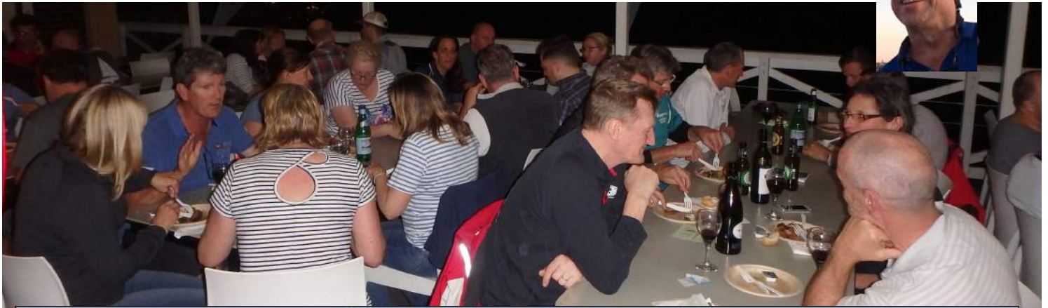
2017-2018 Twilight Series Race 4 - TL4 - 03 November 2017