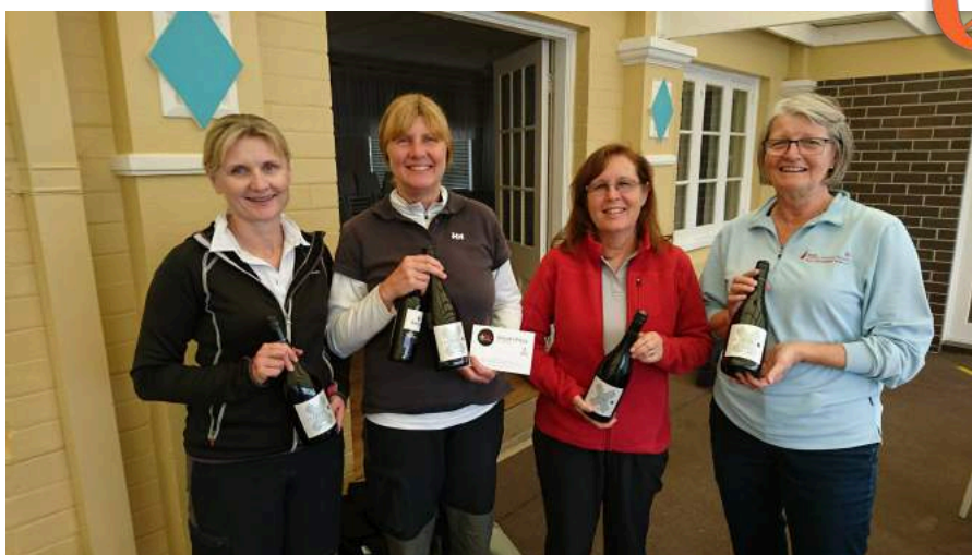
In MYC Summer Series Race 3, 5 boats from 9 starters had female helms!