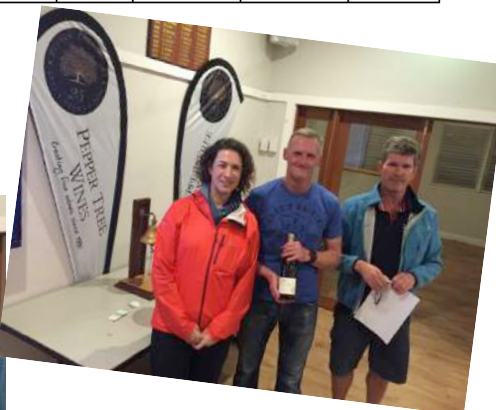
3 rd "Jackpots" to Magician V