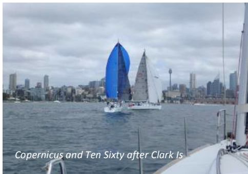
Copernicus and Ten Sixty after Clark Is

Radfords “battle it out”... images taken from San Toy