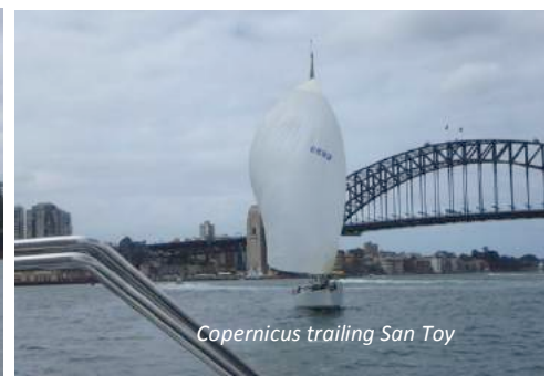
Copernicus trailing San Toy