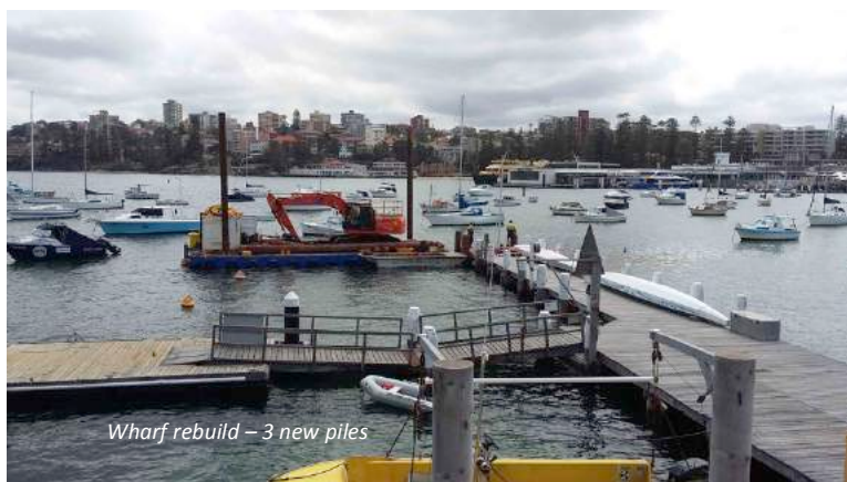
Wharf rebuild – 3 new piles