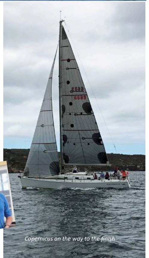
Copernicus on the way to the finish

POSITION VACANT EVENT CO-ORDINATOR FOR NEXT SEASON SO THAT WE CAN CONTINUE THIS WORTHY CAUSE