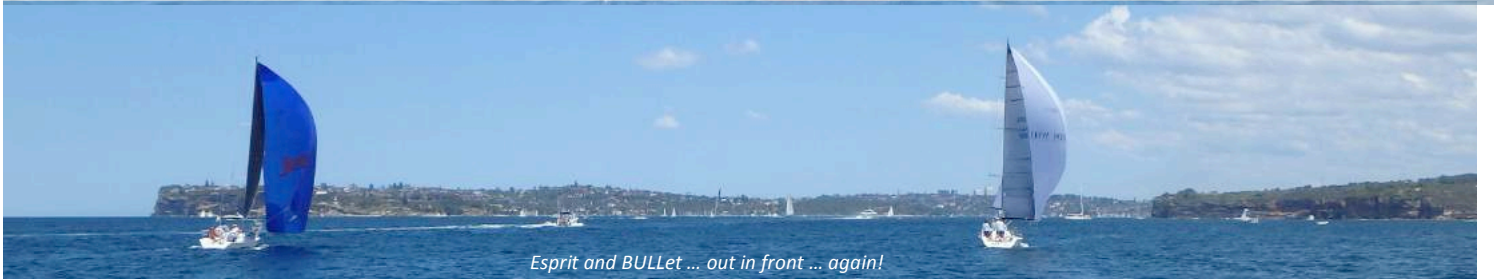
Esprit and BULLet ... out in front ... again!