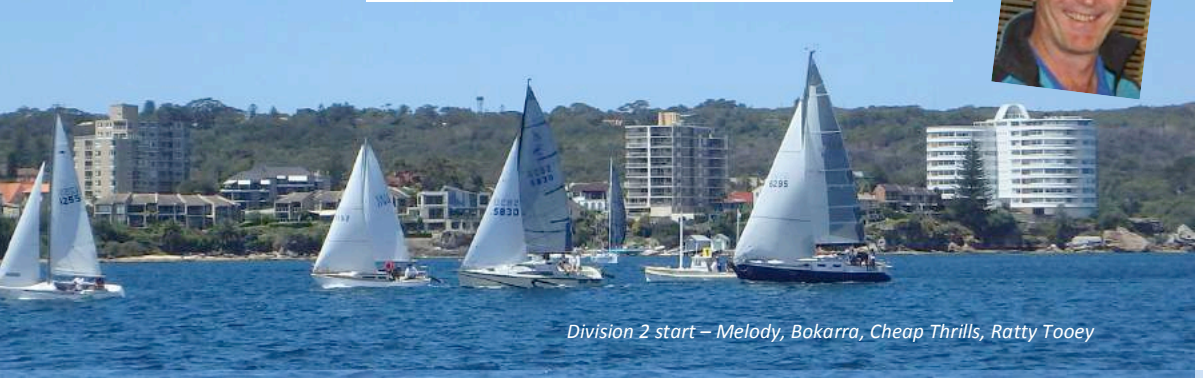
Division 2 start – Melody, Bokarra, Cheap Thrills, Ratty Tooley